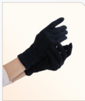
AS017 仕女手套 - 黑色 - Free Size