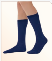
LS027 高筒襪 - 寶藍 - 24cm - 26cm