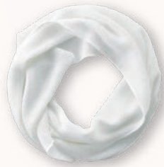
AS001 萬用方巾(兩條裝) - 白色 - 60cm x 17cm